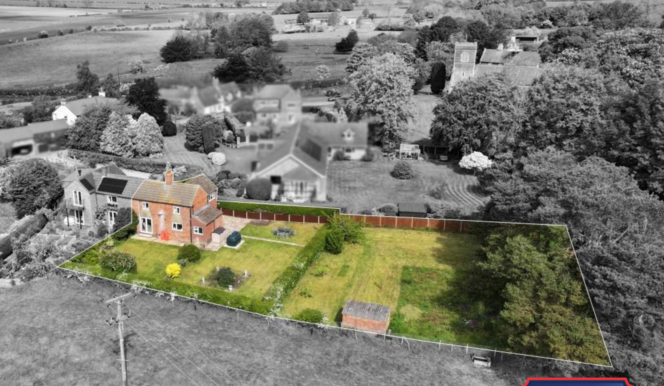
2 Vernons Cottages Hemingby, Horncastle, Lincolnshire. LN9 5QF